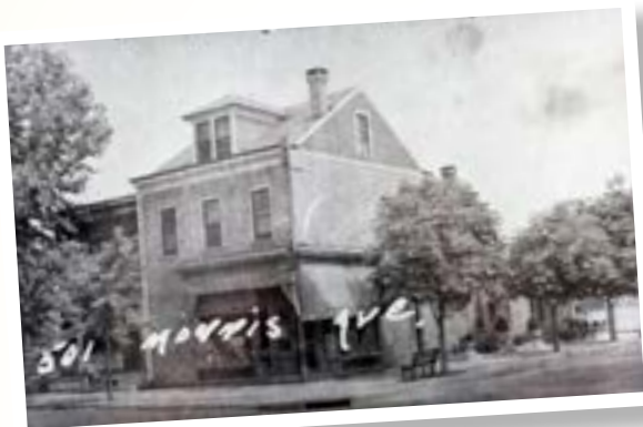
Rossi's Tavern circa 1940 with original Chestnut trees