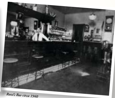
Rossi's Bar circa 1940